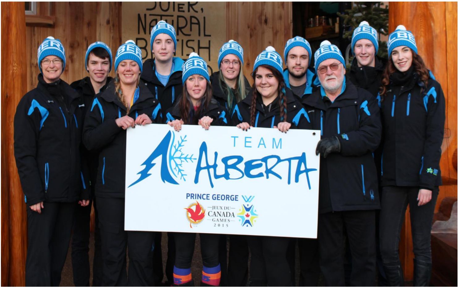
Alberta Shooting Team Canada Winter Games